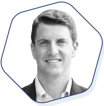
HENRY STERN Senator California Senate