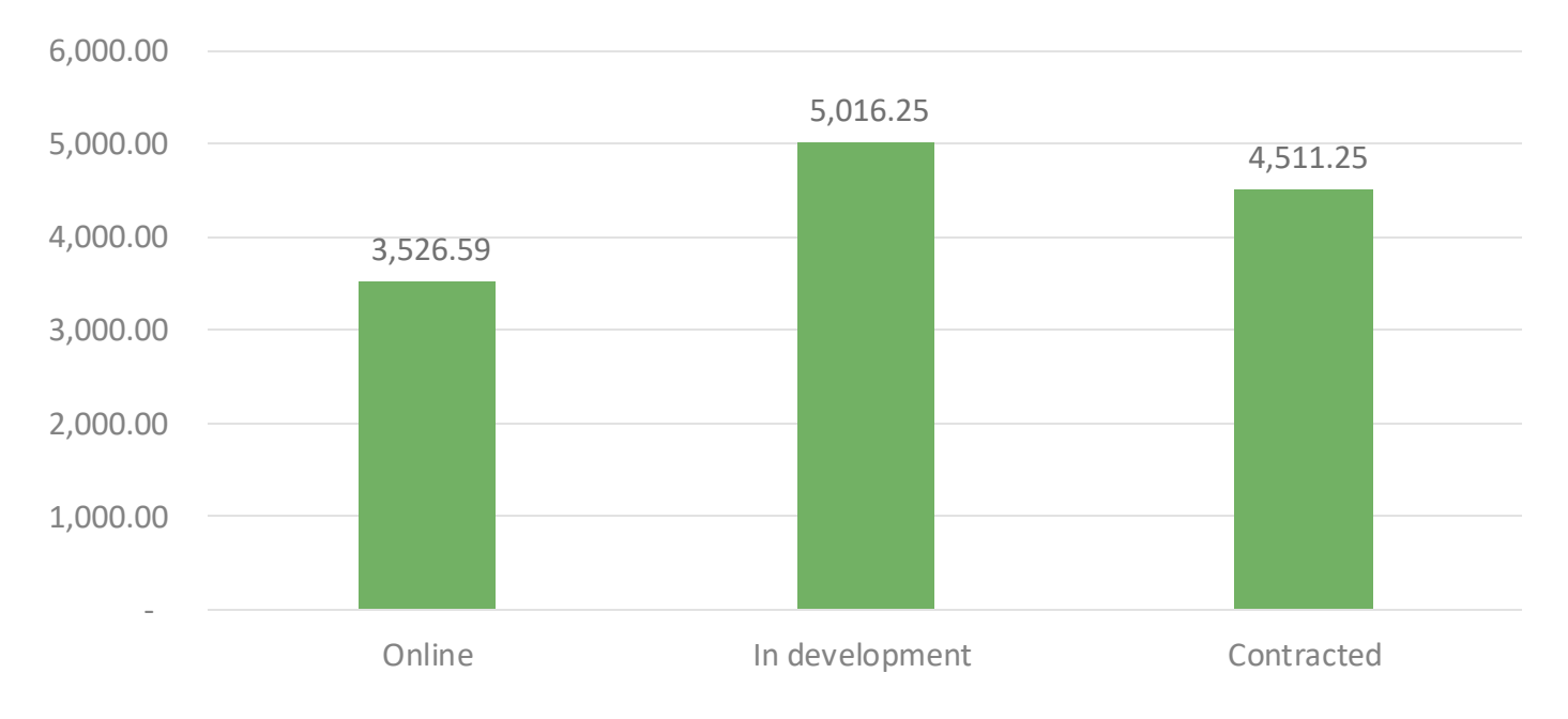
Chart 1. Energy storage procurement since 2010 by status (MW)